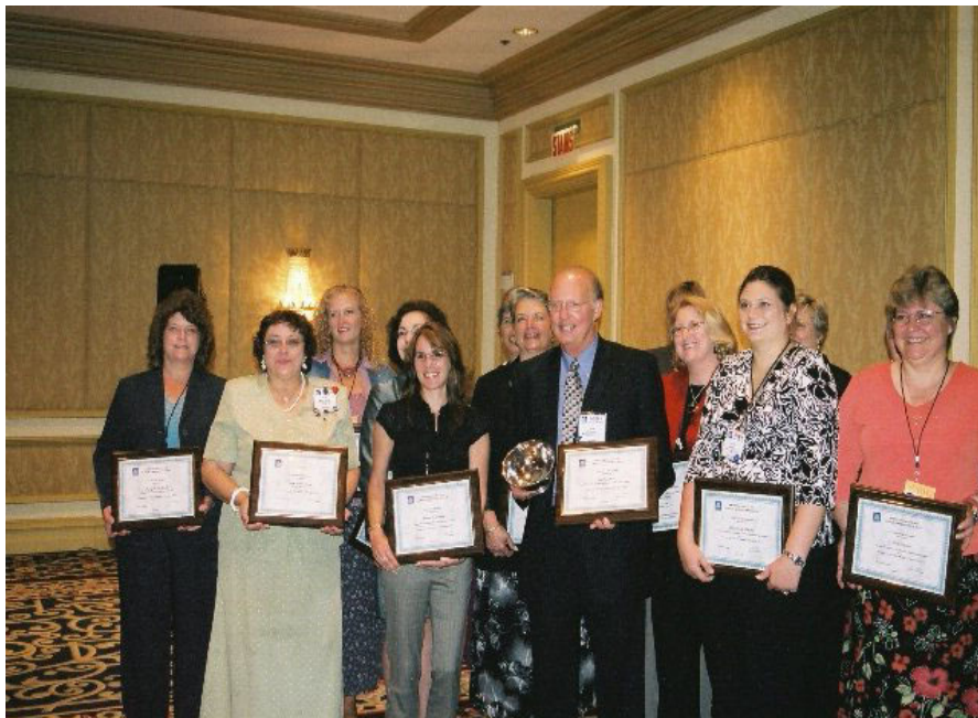
National Member of the Year Group Photo